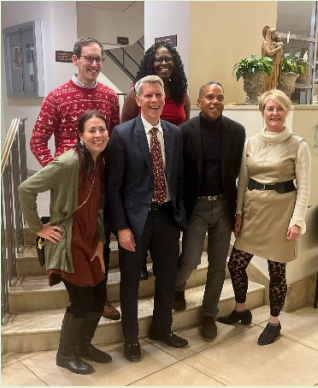
2022 FBA Board at Holiday Party