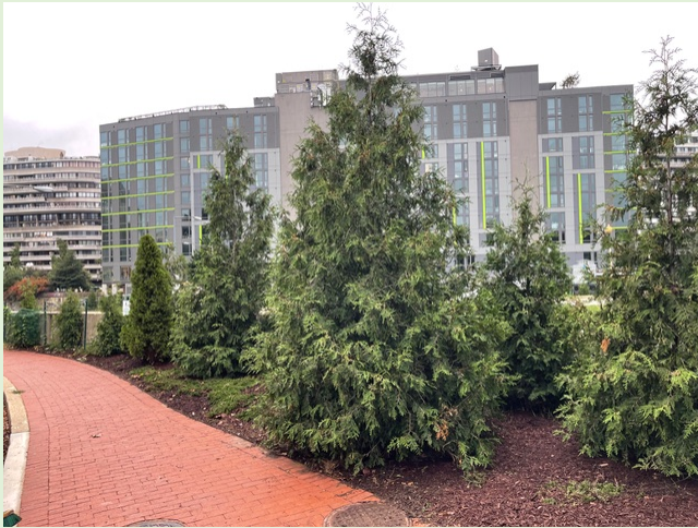
FBA-planted evergreens at the 26th & I curve

The Garden Committee thanks the many volunteers!